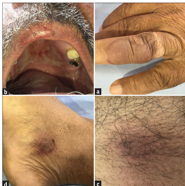
Figure 1: (a-d) The patient's skin and oral lesions at arrival

The first clinical diagnosis was FDE. However, given the extent of mucocutaneous lesions, the biopsy was considered to differentiate FDE and early SJS. Incisional biopsies were prepared from the margin of abdominal and malleolar lesions. The microscopic studies of abdominal skin tissue showed hyperkeratosis of the epidermis, mild hydropic degeneration of basal layer, mixed inflammatory infiltration in the dermoepidermal junction with eosinophilic predominance, neutrophilic infiltration of blood vessels and melanin incontinence in the papillary dermis [Figure 2]. The malleolar skin biopsies showed similar hyperkeratosis and hydropic degeneration. In addition, saw tooth appearance, mild spongiosis as well as lymphocyte-predominant inflammatory infiltration of dermoepidermal junction were seen in the malleolar skin biopsies [Figure 3]. The pathologic findings were compatible with clinical diagnosis of FDE.