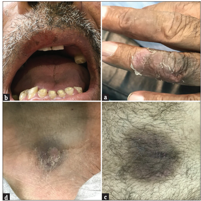
Figure 4: The recovery of patient's skin and oral lesions within next weeks following withdrawal of the causative medication. Note hyperpigmentation of recovered lesions characteristic of fixed drug eruption. (a) patient's finger lesion, (b) upper lip lesion, (c) malleolar skin, (d) abdominal skin